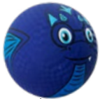
$75: Playground Ball*