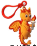
RAISE $5: Hearty