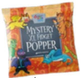
$500: Mystery XL Fidget Popper*